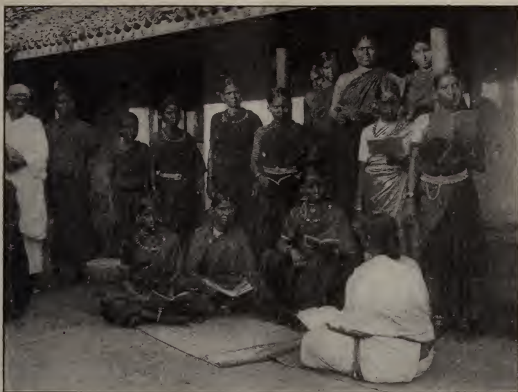
SOME OF THESE ARE FROM THE SILK WEAVER'S HOUSE